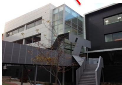
Health Education & Research Building (HERB)

There will be signs and staff to direct you to the lecture theatre.